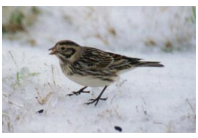
Female Lapland Longspur